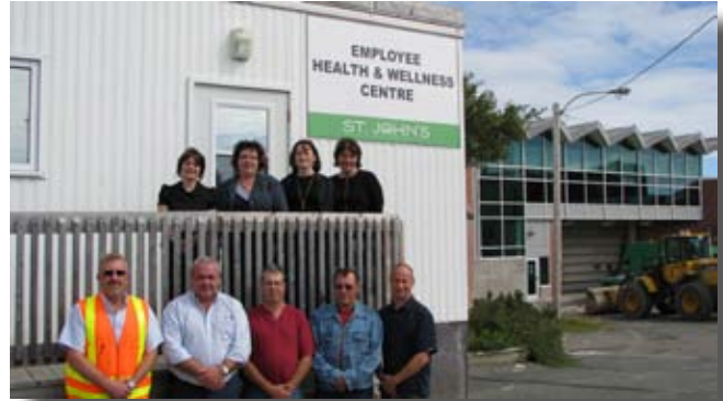
Employee Health and Wellness Centre and members of the Wellness Team.

On October 1, 2008 the City of St. John's opened its Employee Health and Wellness Centre located at the City Municipal Depot. The main focus has been to promote a culture where all city employees can achieve and maintain optimal health and wellness. The Health and Wellness Centre will be coordinated by the City's Employee Wellness Division with programs offered ranging from personal wellness assessments and planning, to educational seminars on health related topics.