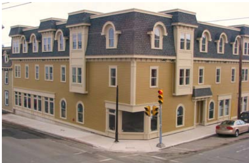
135 Military Road