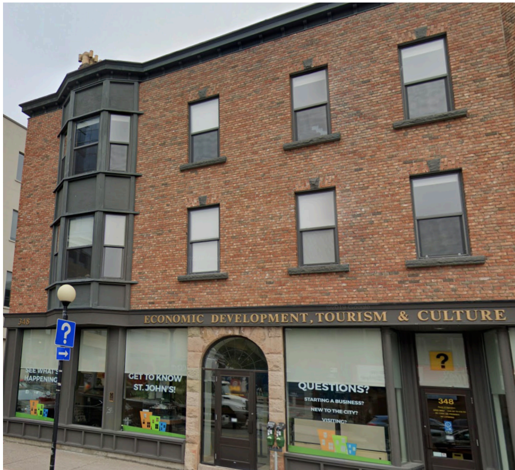
348 Water Street.

Whether you are an established company or starting a new business, the City of St. John's is here to help. We provide free assistance to help you identify which regulations can impact your business and we will help you find the information you need to navigate business start-up requirements.